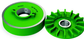
Expellers / Expeller Rings / Stuffing Boxes