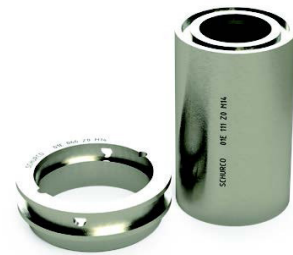
Sleeves, Shafts, Seal Rings, Lantern Rings, O-Rings, Packing And Much More